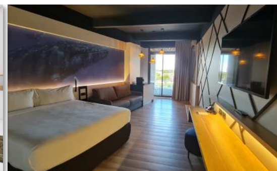
Hotel Kon Tiki