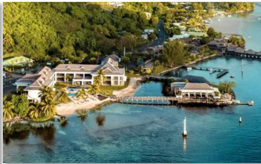
Cooks Bay Resort