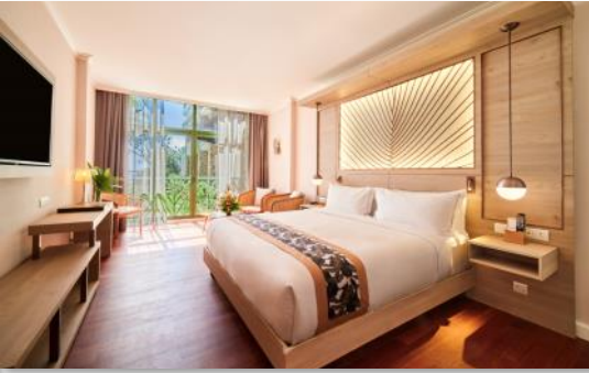
Hilton Tahiti Resort & Spa

1 Night Papeete at Hilton Tahiti Resort & Spa in a 1 King Bed Standard Room