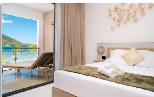
Cooks Bay Resort & Suite