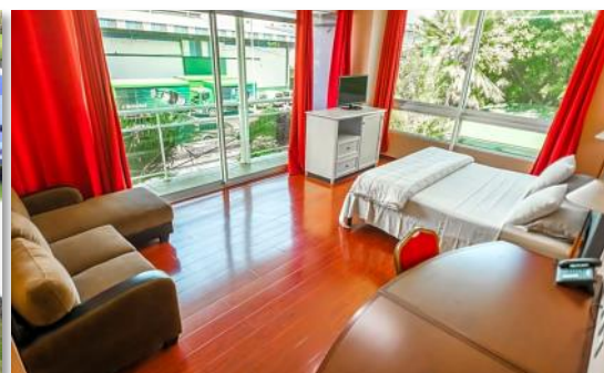
Hotel Sarah Nui