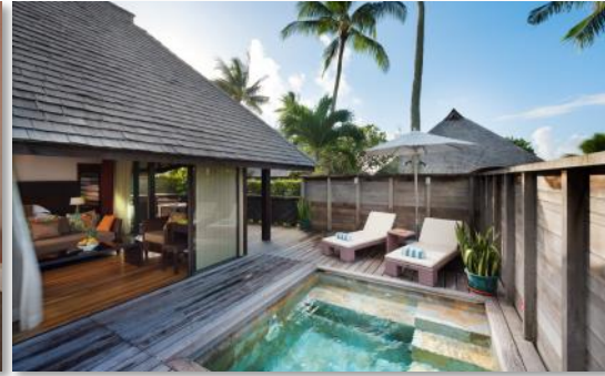
Hilton Moorea Resort & Spa