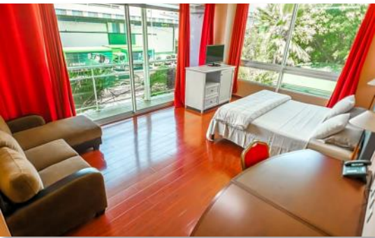
Hotel Sarah Nui

1 Night Papeete at Hotel Kon Tiki in a Tahitian Room