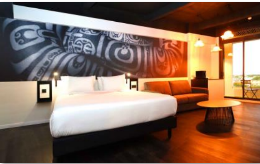
Hotel Kon Tiki

2 Nights Papeete at Hotel Tahiti Nui in a Standard Room (Street View)