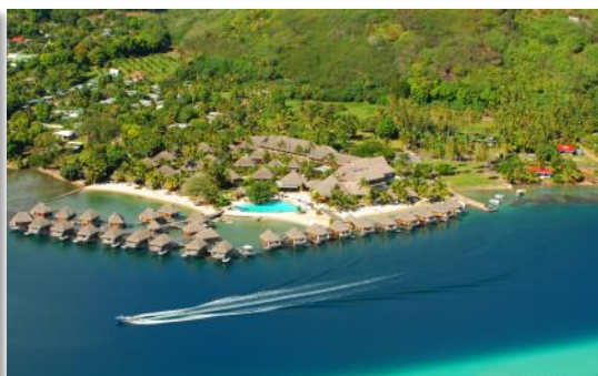
Manava Beach Resort