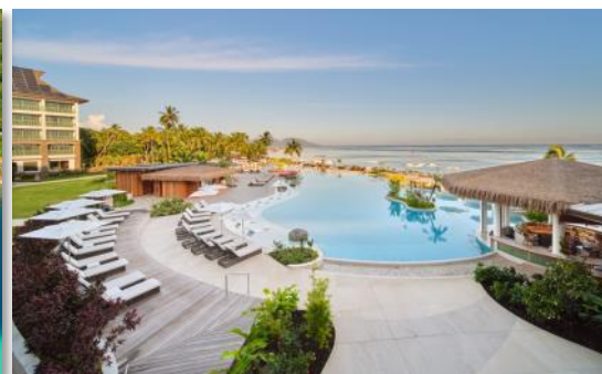
Hilton Tahiti Resort & Spa