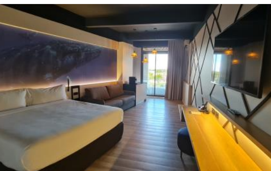
Hotel Kon Tiki

2 Nights Papeete at Hilton Tahiti Resort & Spa in a 1 King Bed Standard Room