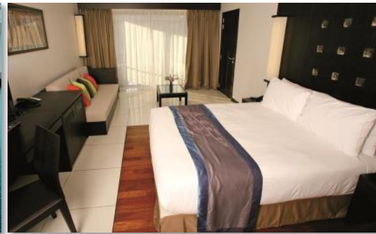
Hotel Tahiti Nui