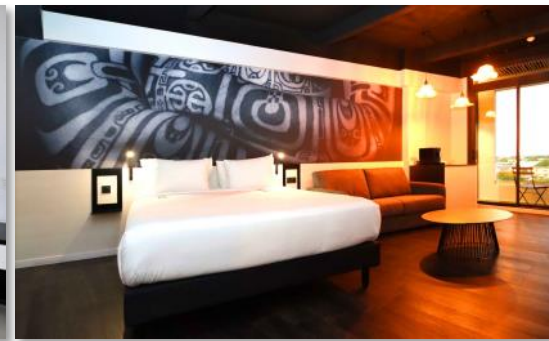
Hotel Kon Tiki

PACKAGE 2: PRICED FROM $1,547 per person (DBL/Twin share)