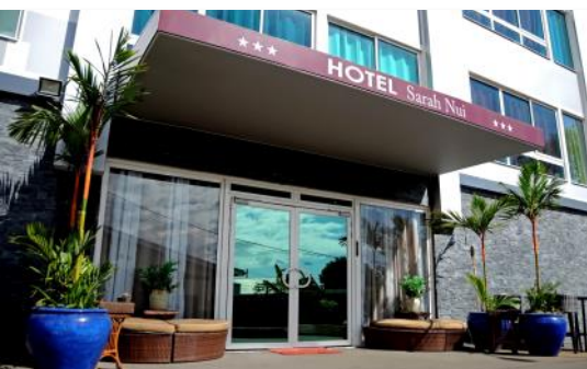
Hotel Sarah Nui

2 Nights Papeete at Hotel Sarah Nui in a Premium Room (King Bed)