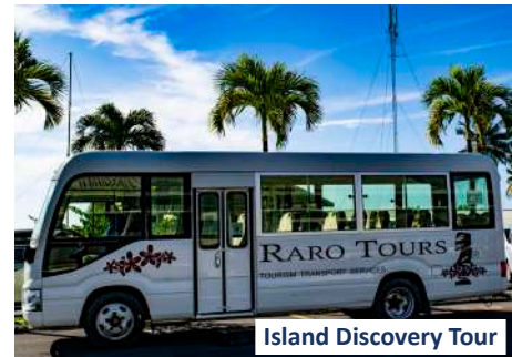
Island Discovery Tour