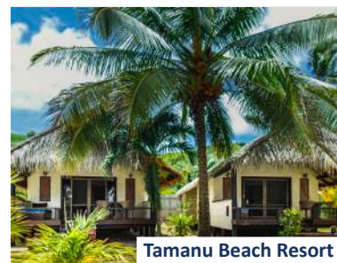
Tamanu Beach Resort