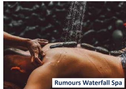
Rumours Waterfall Spa