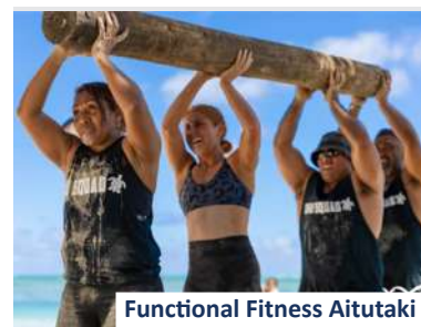
Functional Fitness Aitutaki