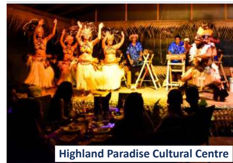
Highland Paradise Cultural Centre