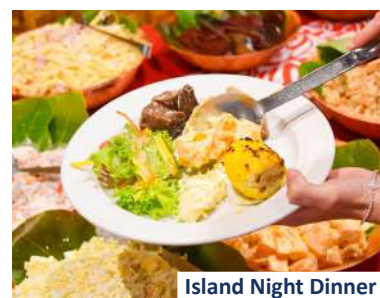
Island Night Dinner