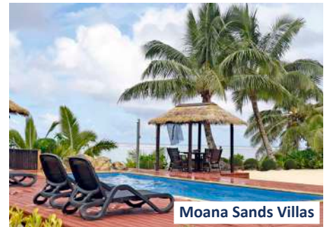
Moana Sands Villas