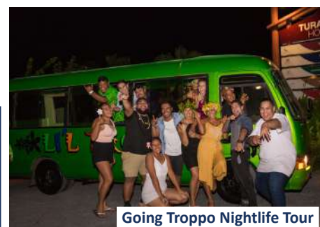
Going Troppo Nightlife Tour