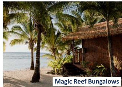
Magic Reef Bungalows