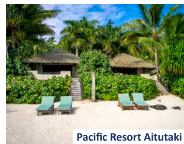
Pacific Resort Aitutaki