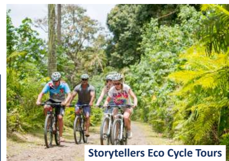
Storytellers Eco Cycle Tours