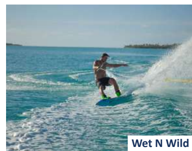
Wet N Wild