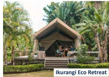
Ikurangi Eco Retreat